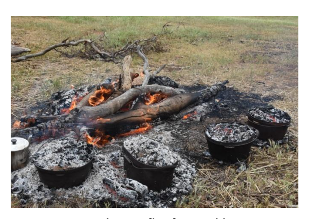
a good campfire for cooking