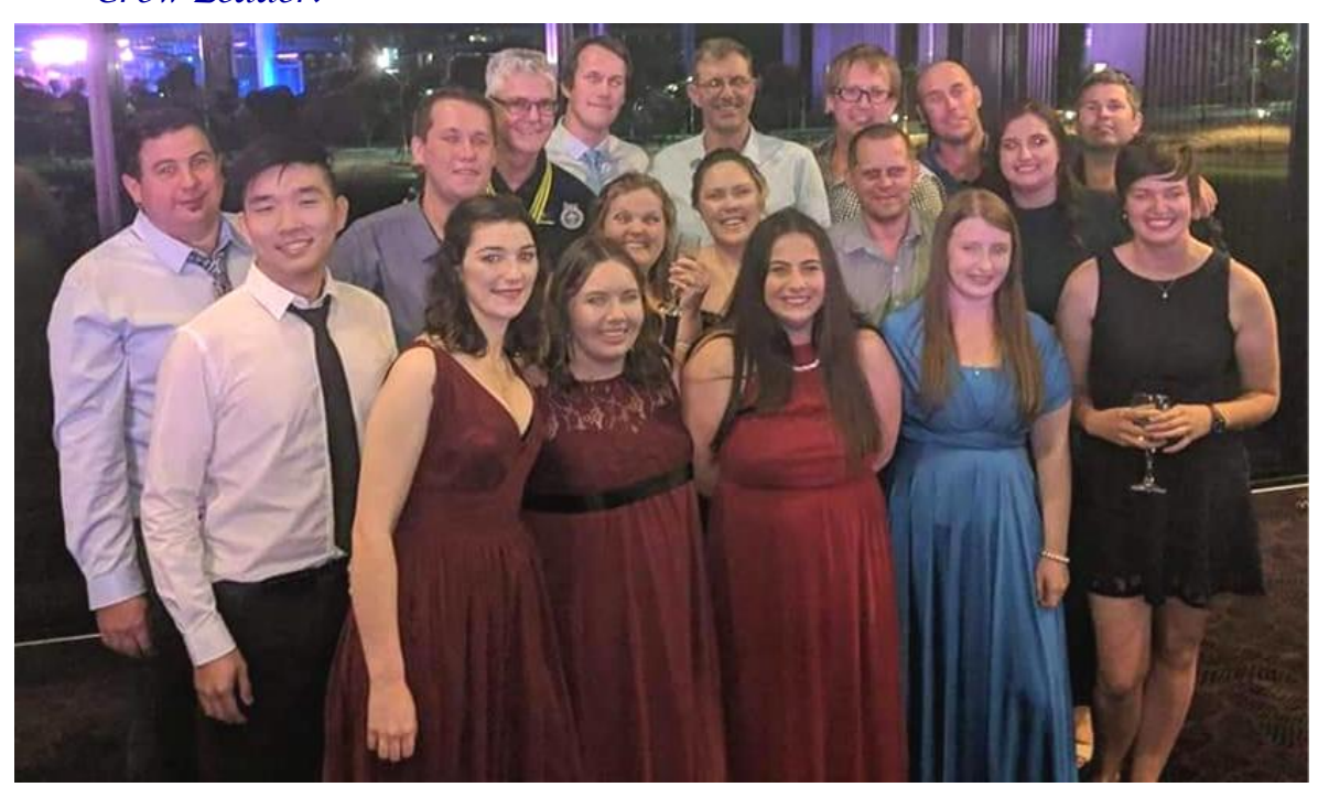
Some of our Past & Present Lone Rovers enjoy The Centenary Dinner & Sandblast