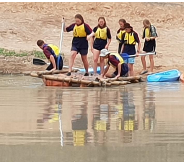
Lone Venturers at SuperSplash