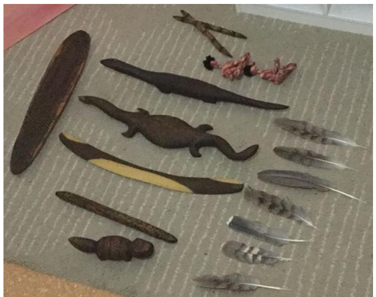
William's Aboriginal artefacts & fresh bush turkey feathers