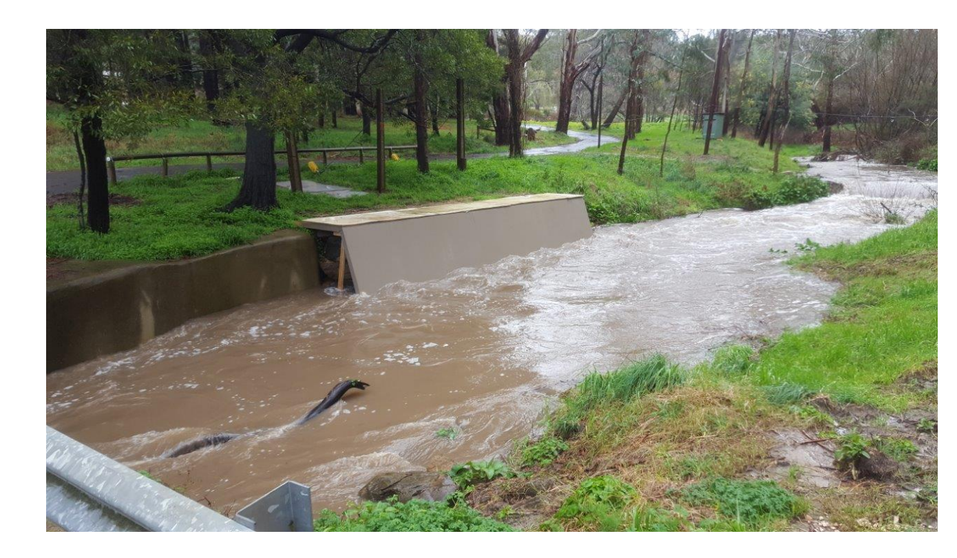
Cox Creek, Woodhouse after a bit of rain August 2018