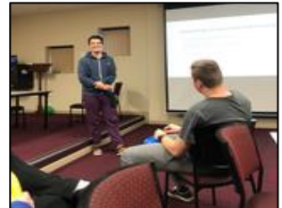
Rover Summit at Scout HQ