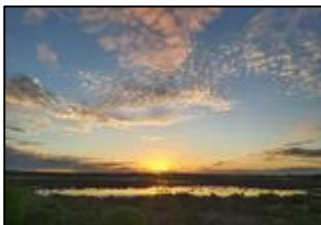
Sunset Photos around Australia