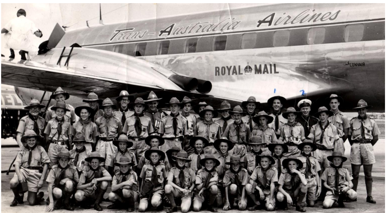
SA Lone Scout Camp "outing" c.1951