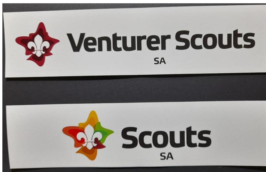
Car Stickers, thanks to Think Big Printing