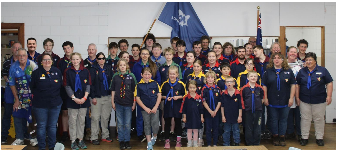
SA Lones at Annual Camp, September 2021

Your Lone Trail is brought to you by: W.G. Fuss & Sons, Cummins SA & SA LONE SCOUT GROUP