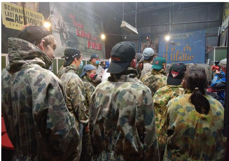
Lone Scouts & Venturers Paint-balling