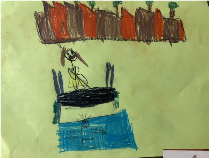
Grace's drawing – jumping off the pontoon at Fisherman's bay with Dad catching her