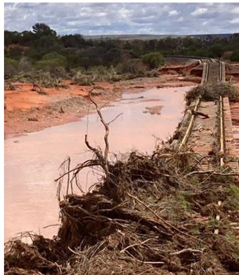
Flood repairs to The Ghan rail kept Andre busy