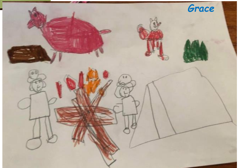
Brownsa Island Camps seen through the eyes of our Joeys.