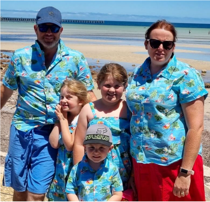
Scott Family on Christmas Holidays