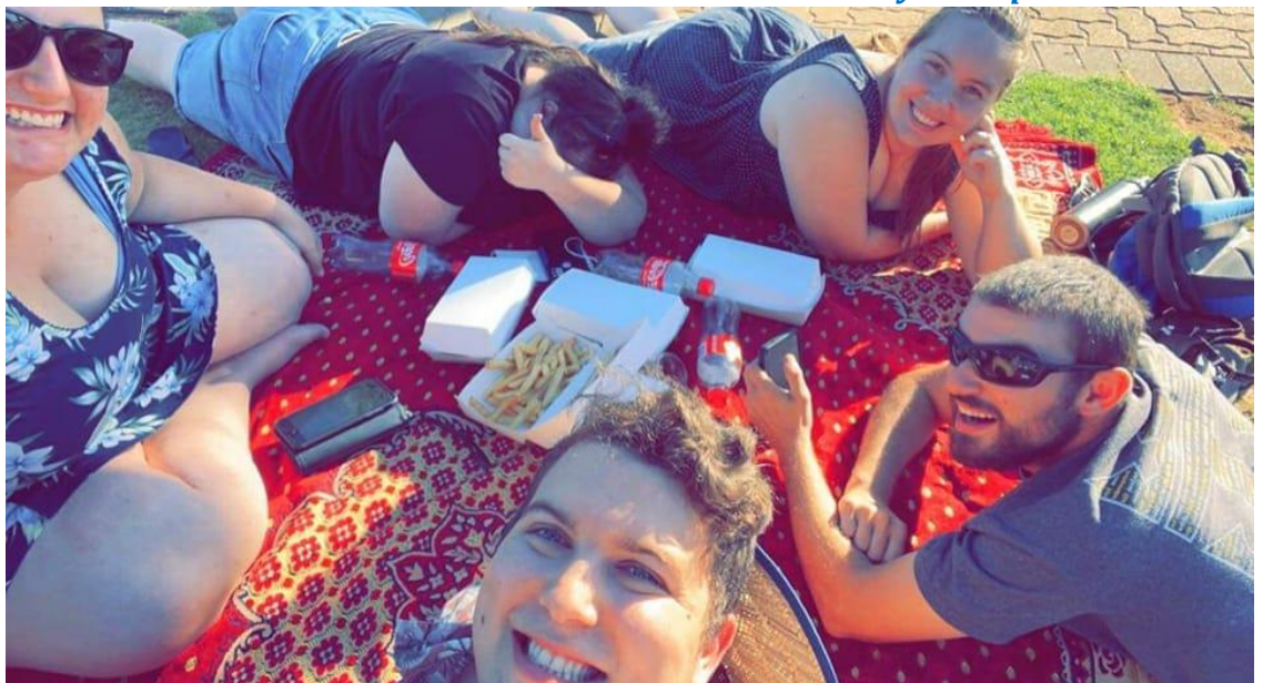
Beach Day Semaphore