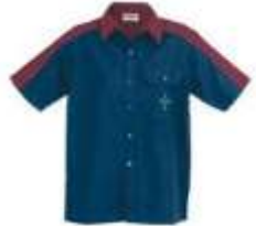
Venturer Navy/ Maroon Button shirt only

For formal occasions the uniform should be worn with stone coloured pants or skirt. For all other events can be either blue, black or stone pants or shorts.