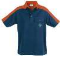
Joey Navy/ Rust Polo shirt only

From the night of investiture, your child will be expected to wear uniform. Scouts shirts are only available from the uniform department of the Exurbia Uniform shop, 134A The Parade Norwood or you can visit them online at https://exurbia.com.au/scout-shop/