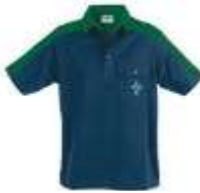
Scout Navy/ Green Polo or button shirt