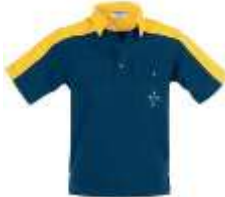
Cub Navy/ Yellow Polo or button shirt